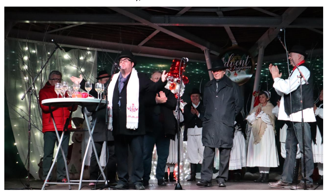
Autochton sort Kleščec evening Friday, 10<sup>th</sup> December 2021