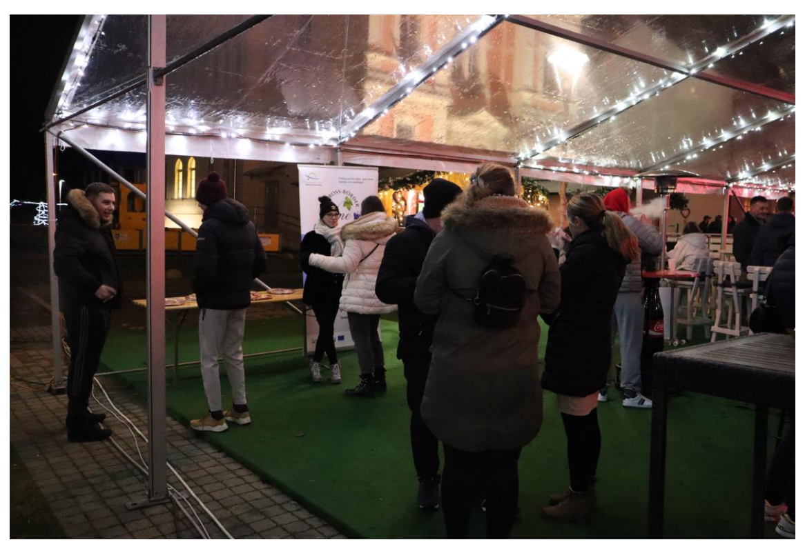
Champagne and sparkling wines evening