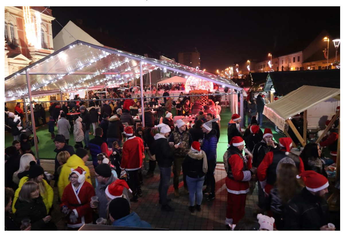
Sweet Christmas evening Sunday, 19<sup>th</sup> December 2021