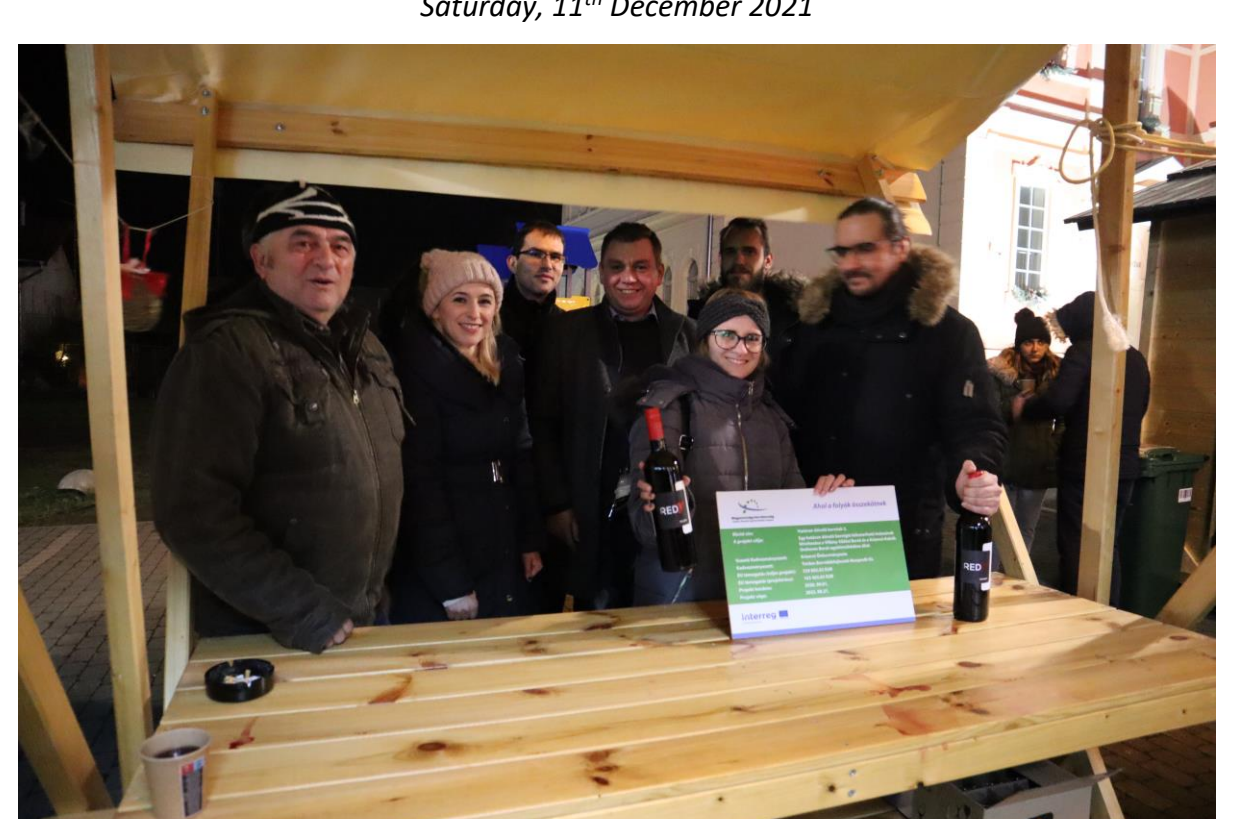
Bilikum evening Friday, 17<sup>th</sup> December 2021